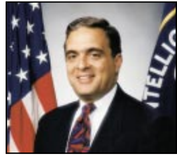
Jews in the first Bush administration who drove the war in Iraq: from left to right: Paul Wolfowitz, Deputy Defense Secretary and campaign advisor; Douglas Feith, Under Secretary of Defense and the Pentagon's Policy Advisor; Richard Perle, Chairman of the Defense Policy Board Advisory Committee; George Tenet, head of the CIA.