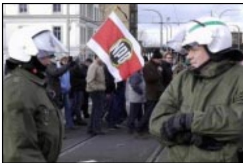
Right: the NPD rally in Berlin, 8 May; other pictures from the Dresden march, 13 February, commemorating the air raids of 60 years ago.

The NPD's recent electoral success in Saxony means that it is bolstered by a monthly cash injection of 120,000 Euros ($155,000) from that state. This has contributed greatly to its increased professionalism and ability to get its message out.