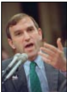
Jews in the first Bush administration who drove the war in Iraq: from left to right: Elliott Abrams, National Security Council Advisor; David Frum, White House speechwriter; Joshua Bolten, Bush's Chief Policy Director; James Schlesinger, another Pentagon advisor who also sits on the Pentagon's Defense Policy Board.

* Work closely with Turkey and Jordan to contain, destabilize, and roll-back