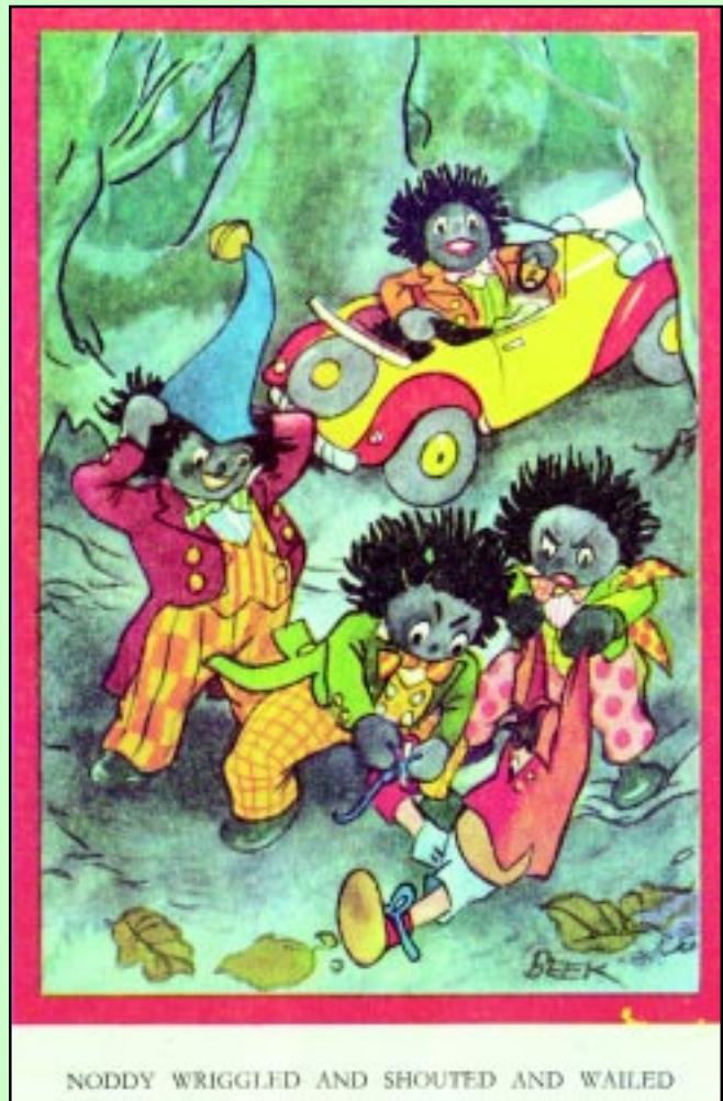
NODDY WRIGGLED AND SHOUTED AND WAILED